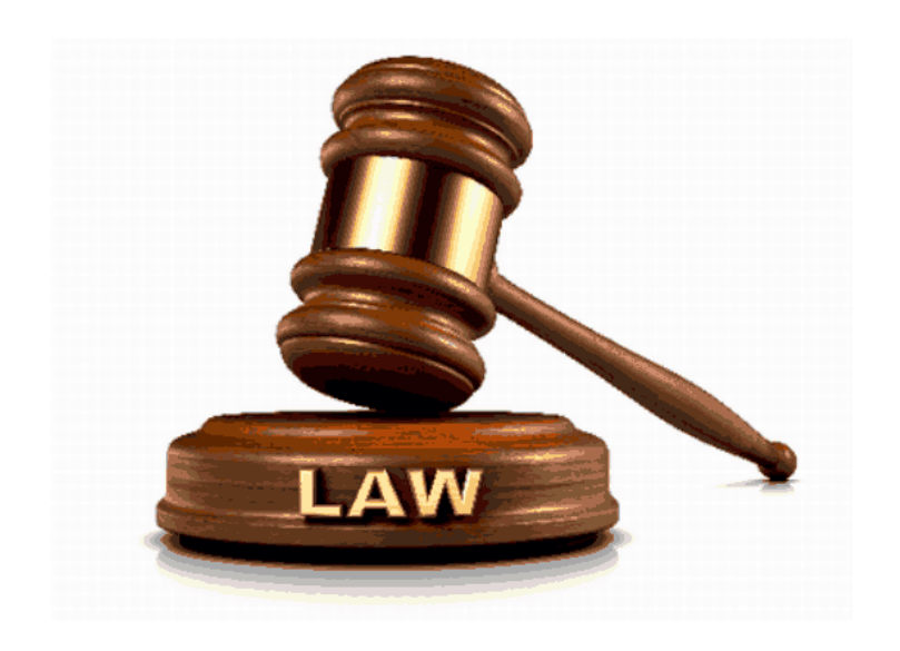
N.J.A.C. 6A:14-1.2(h) Special Education Parent Advisory Group

"Each board of education shall ensure that a special education parent advisory group is in place in the district to provide input to the district on issues concerning students with disabilities."